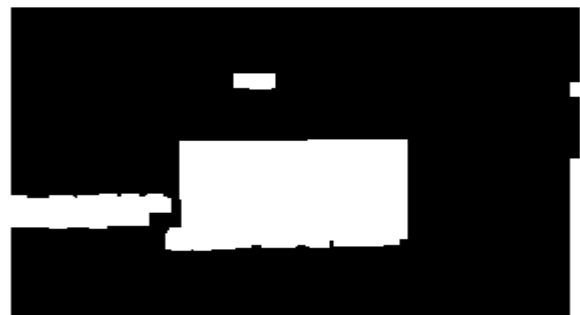
Fig. 5: Image after Dilation of the Binary Image