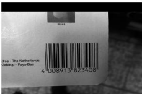
Fig. 2: Image after conversion to gray scale and Contrast Stretching