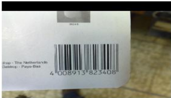
Fig. 1: Original Image from which barcodes are to be localized [7]