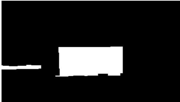
Fig. 6: Image after eroding the resultant so as to eliminate thin objects