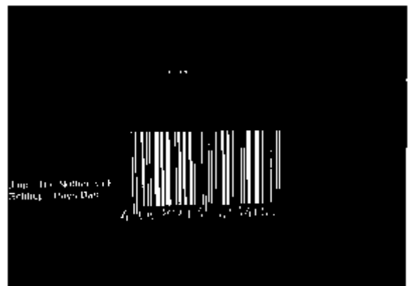
Fig. 4: Image after binarizing the resultant of Bottom- Hat filtering using Otsu's Threshold method