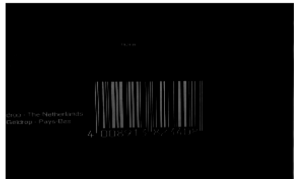
Fig. 3: Image after performing Bottom- Hat filtering to highlight bars.