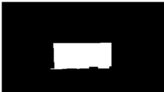
Fig. 7: Image after removing small area objects