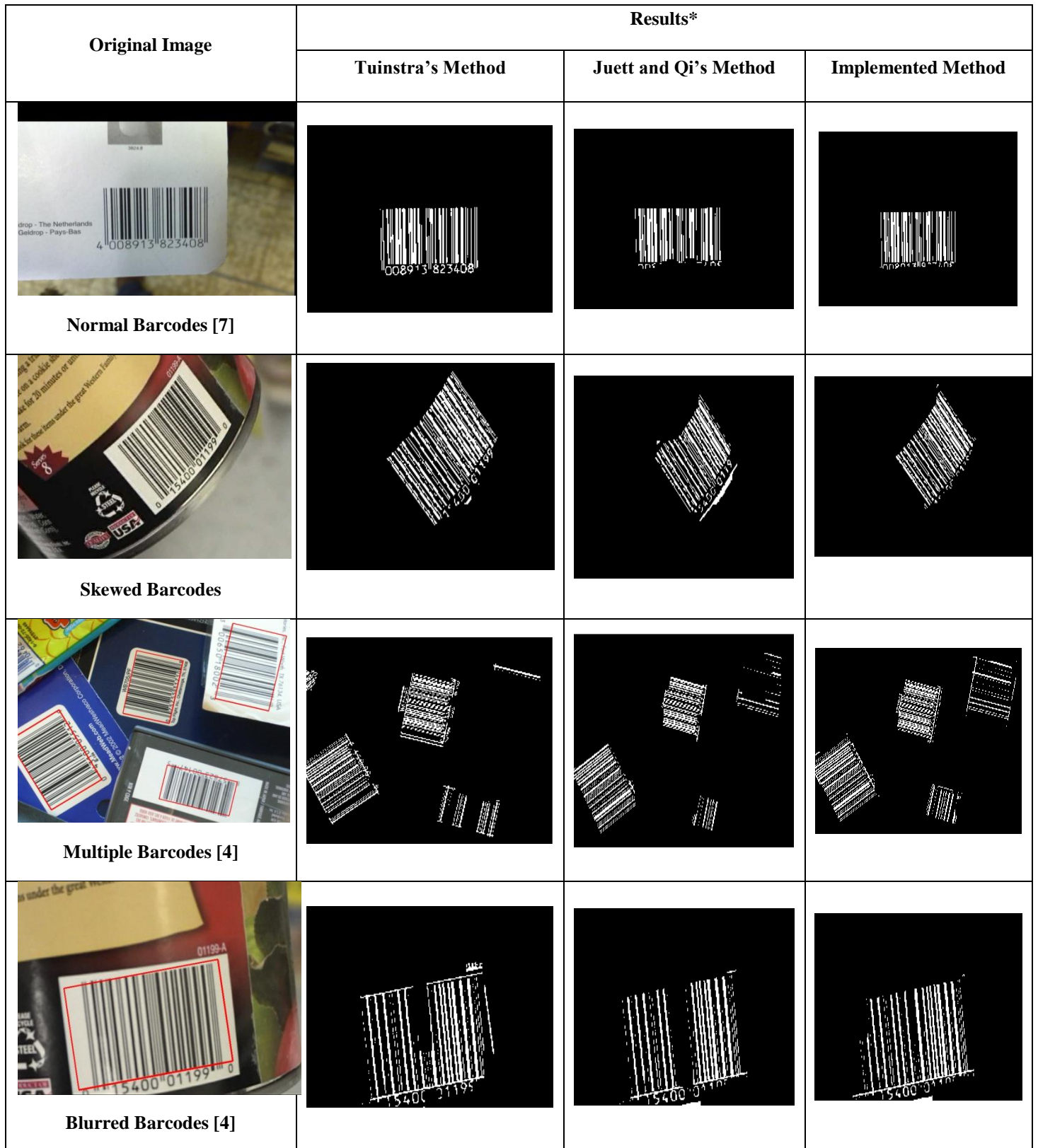
Table I: Table showing Qualitative analysis of different test images using existing methods and method implemented