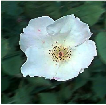
Fig. 2(a) Original image