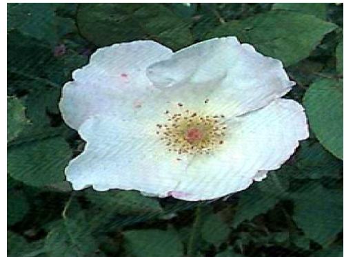
Fig.5 Resultant image after deblurring

This is the last step in our motion deblurring algorithm. The results of inverse filtering technique used is given in Fig.5. The results shown in the following figure show that a clear deblurred image is obtained using this algorithm.