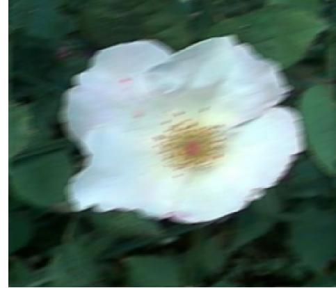
Fig.4 Image with uniform blur

The segmented convoluted image is combined to the background blurred image to obtain a blur which is uniform over the entire image. The result is as shown in figure 4.