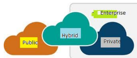
Figure 1: Cloud Computing Deployment Model

Therefore, in order to decide which type of cloud to deploy, business managers' need to access the security considerations from an enterprise architectural point of view.