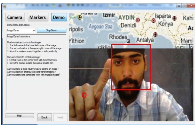
Figure 4: Information Control & Exchange: Image controlling using only my finger: Use of my finger tip without using any coloured agent (sketch pen) or any artificial material as an external parameter. Resizing of the image is also achieved by the same procedure