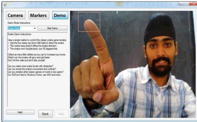
Figure 3: The Desired Output for Pin Point Accuracy: Use of my Fingertip with my finger being used in its natural form