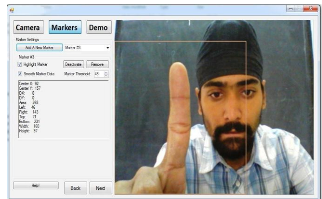
Figure 1: Multiple recognitions in case of similar features: The colour of my finger and the skin of my face are similar; when kept in close affinity they both are getting recognized