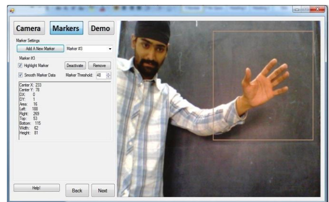
Figure 2: Palm Recognition: The skin colour of my face & the skin colour of my palm are different due to varying brightness & contrast in my surrounding environment. Hence, the only the palm is getting recognized