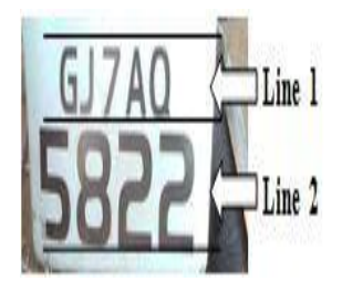
(a) Skewed image