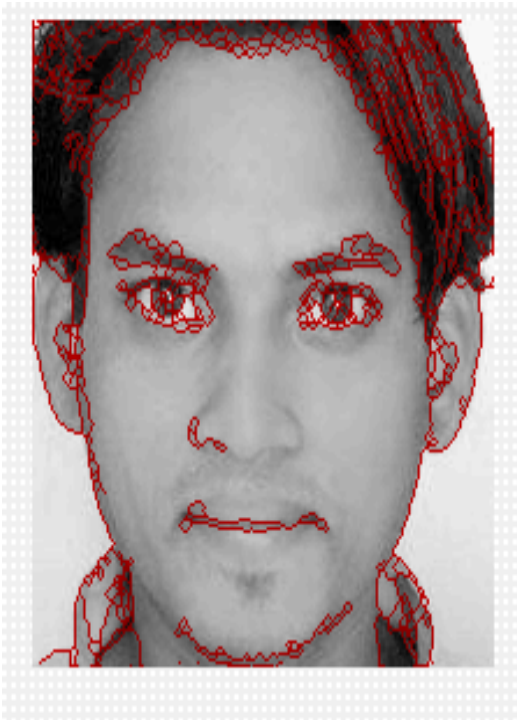
Fig 1: Template extraction of the highlighted features of the image.