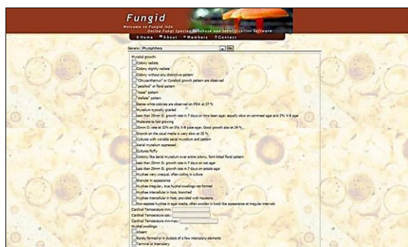
Fig. 4. The Scan section with a form that the user must fill in with morphological features of the unknown species. None of the characters were defined as required icons.

In Scan icon (the most important icon of the program), the user can choose the genus name via a combo-list. After selecting the genus and clicking on Go , the user can fill in the form of the Scan page which is based on morphological features. None of the characters were defined as a required matter. By mouse clicking on Scan, the software compares the entry with submitted information in the database and finally, one or more than one species are proposed to the user (Fig. 4).