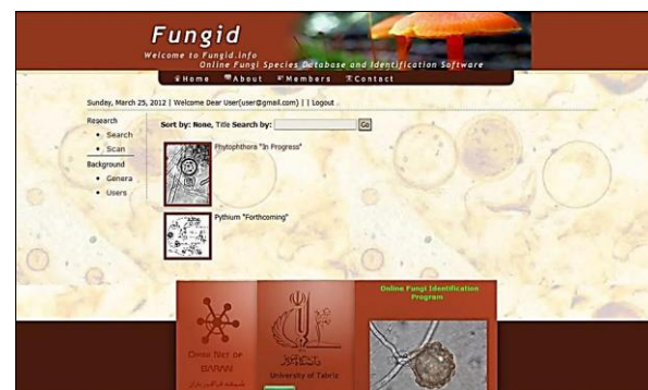
Fig. 6. The Genera section of the program.

We try to complete the details of the species via adding the descriptions and images. One of the major limitations in the creating web documents is copyright. Many copyright holders are reluctant to permit use of their images, because anyone can save the image to a file on their computer and use it later without obtaining permissions [33]. Although, we linked each species to useful websites like that Q-bank and Index Fungorum. So our trying to complete the program will be a gradual work. In Genera icon, user can see the genera that have been defined to the program with their species. Some of Genera labeled with "in progress" and/or "Forthcoming", that it means the process of completeness of the genera are not finished and it is under maintenance and the process of preparation of the genera and its species will start soon (Fig. 6).