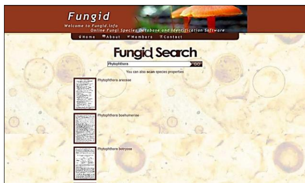
Fig. 3. The Search section of the program.

In Search icon, the user can do a general exploring based on the fungus name and find it (Fig. 3).