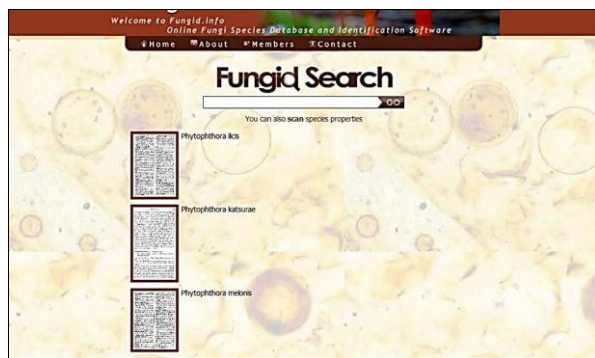
Fig. 5. Search result page of the program.

Based on the species details, the user can decide to choose the most similar species that it is highly matched to his/her isolate (Fig. 5).