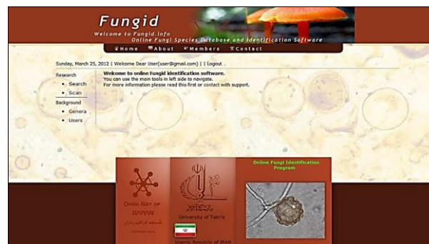
Fig. 2. Database layout of the Fungid.

In the first menu, the users must fill in the form with his/her username and password to enter and see the database contents. Certain of ID for users are supported by Administrator of the website. Users must send their request to receive the ID through the Contact menu. After log in, users can see the contents of the database such as Search, Scan, Genera and User icons without any possibility to edit or delete them (Fig. 2).