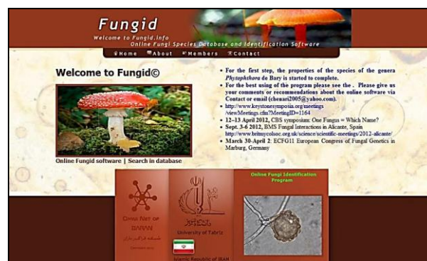
Fig. 1. Homepage of the Fungid.

In Fungid homepage ( www.fungid.info ), there are two main icons, Go to Database and Search in Database (Fig. 1).