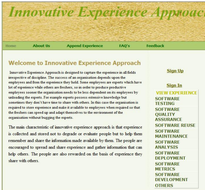
Fig 2: Snapshot of implementation of approach.