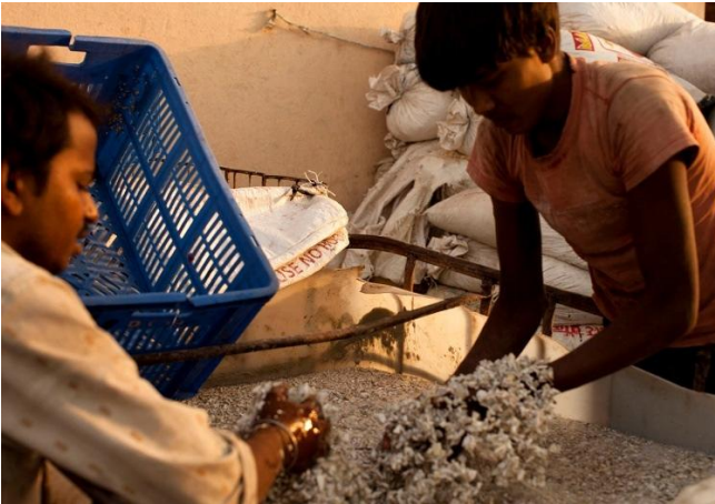
Manually washing E waste plastic Image 2