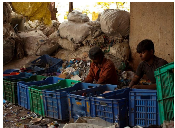
Workers manually sorting E waste components Image 1

The scene is green and picturesque, with newly planted fields on either side of the road. There is a sudden break and we come upon Chikhali village. The village is crowded and congested and there are 8-10 units, much smaller than those at Handewadi that deal almost exclusively in E waste. The scale of business appeared to be small. The owners were around and were very communicative. Some of them had worked as dismantlers. They held out their hands to show the acid scars. We do not see any small children among the workers; the younger ones appear to be 16-17 years old. They did not live on site and did not seem to be 'bonded labor'. It seemed as though they were learning the trade as apprentices. Chikhali appeared to be a transit point with many dilliwallas storing their material in the godowns.