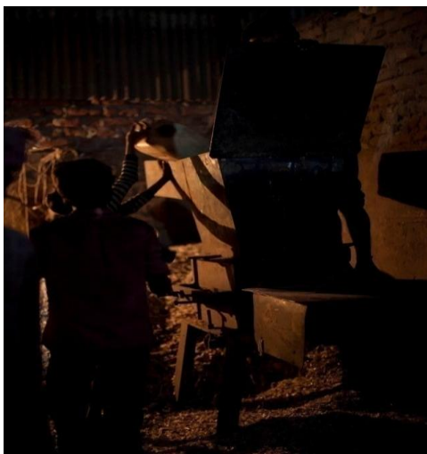
Shredding E waste plastic Image 3