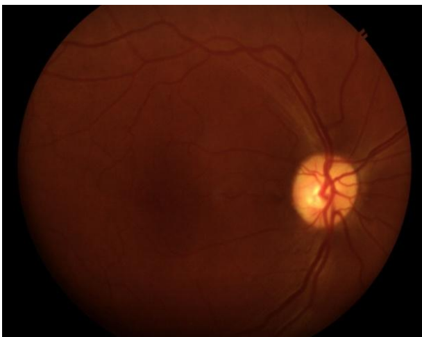
Fig. 4: Digital fundus camera and acquired retinal fundus image [2]

The paper is organized as follows: Section II depicts types of glaucoma, Section III describes different methods for detecting of optic cup and optic disc from retinal image and Section IV concludes the paper.