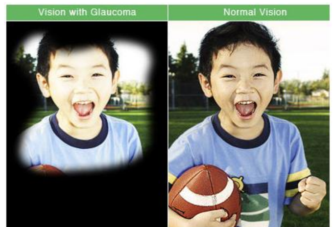
Fig. 2: Vision of Normal and Glaucoma [10]

The digital fundus image of a normal eye and glaucoma tic disc and inferior, superior, nasal and temporal (ISNT quadrants) are illustrated in Fig. 3.