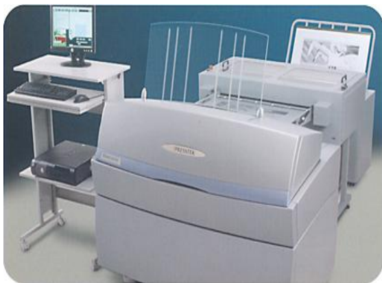
Sophisticated version of Computer-to-Plate (CtP)