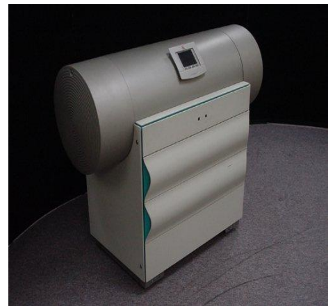
Drum Imagesetters (DOLEV & LOTEM 400/800 Imagesetter Printing Machine)