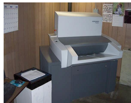
Computer-to-Plate (CtP) manufactured by Heidelberg, German