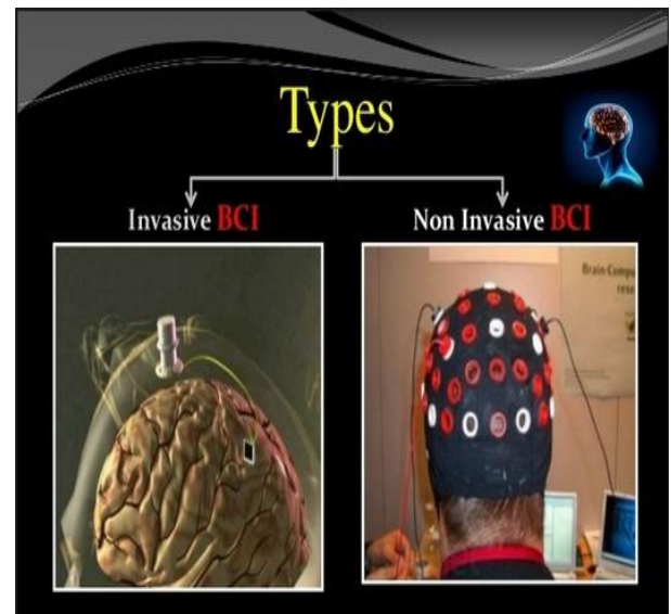
Fig 4: Types of BCI Headset [9]

Magneto encephalography (MEG) and functional magnetic resonance imaging (FMRI) have both been used successfully as non-invasive BCIs. FMRI allowed two users being scanned to play Pong in real-time by altering their hemodynamic. FMRI measurements of hemodynamic responses have also been used to control robot arms with a seven second delay between thought and movement.