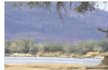
Fig 4: Result by [6]