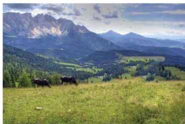
Fig 9: Result using proposed method