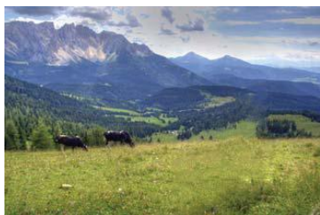
Fig 8: Result by [6]