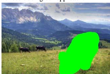
Figure 2 shows original image to be inpainted [6] and figure 3 shows selected region. Figure 4 shows result using [6] and figure 5 shows result using our approach.