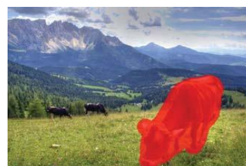
Fig 6: Original Image

Similarly, Figure 6 shows original image to be inpainted [6] and figure 7 shows selected region. Figure 8 shows result using [6] and figure 9 shows result using our approach.