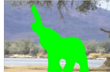
Fig 3: Selected region