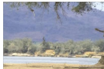
Fig 5: Result using proposed method

Similarly, Figure 6 shows original image to be inpainted [6] and figure 7 shows selected region. Figure 8 shows result using [6] and figure 9 shows result using our approach.