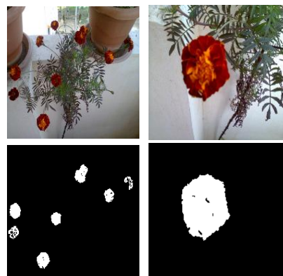
Figure 3: Segmentation results for Marigold flowers