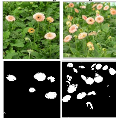
Figure 2: Segmentation results for Gerbera flowers

All experiments are done on core2 duo 2.2 GHz with 2048 RAM under Matlab 7.0 environment. In the experiments, 30 images are employed. The images are taken from two domain i.e. there are 15 gerbera flower images and 15 images of marigold flowers. For these images, all of them are taken by digital camera (Nikon) from various scenes and under different lighting conditions of the real world, varied distances from the flowers. The distance between the camera and the flowers varied from 1 up to 4 meters and the camera is focused in the expected flower regions. The sample results of segmentation are shown in figure 2 and figure 3.