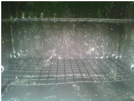
Figure 4: Heating Area

Double flow solar air heater is the advanced modification of single flow solar air heater. In the single flow solar air heater, air flows through one side of copper plate whereas in the double flow solar air heater air flow from both side of copper plate.