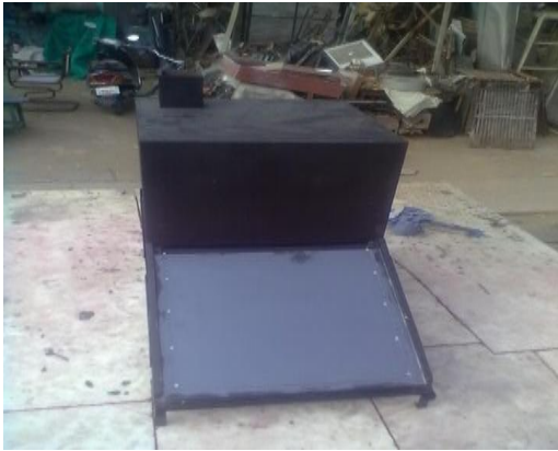
Figure 2: Experimental Setup