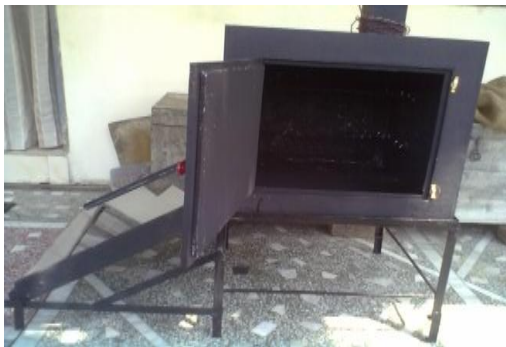
Figure 3: Inner Space