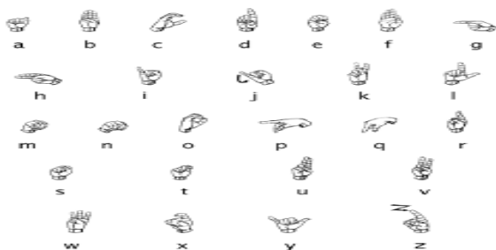
Fig. 2 Static Signs