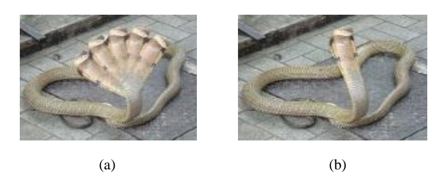
Fig 1: The five head king cobra hoax, (a) a forged image (b)original image

Basically almost all ICA algorithms are good for separation of the instantaneous mixture of the non-Gaussian sources. We here assume that the mixture is instantaneous. Firstly we feed two images, i.e., forged and original image, we mix both the images instantaneously. Then this mixture is fed to an improved version of the FastICA [13, 14]. We have used EFICA [15], algorithm which is asymptotically efficient, i.e., its accuracy given by the residual error variance attains the Cramér-Rao lower bound. The error is thus as small as possible. Finally, we get the estimated independent components as separate image output, making us able to identify the forged regions.