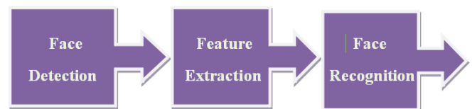
Fig 1: Steps of face recognition system.

The method of identifying and verifying a face from a given database is done in three steps: