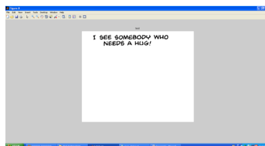
Fig-4 extraction of text from the cluster2 image