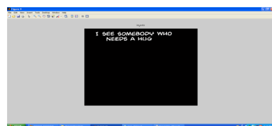
Fig-3 extraction of text from the cluster1 image