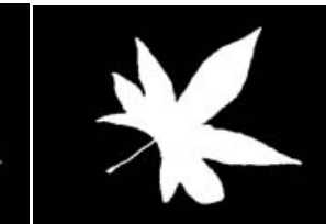
f) Ground Truth