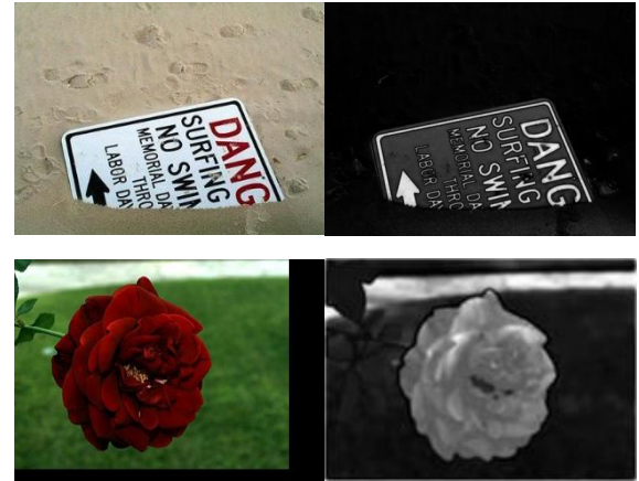
Fig 2: Input Image and corresponding Result obtained by the proposed method

Here \sim S_i is the weighted linear combination of the all Saliency S_j which are surrounded by it. Again here one can prefer the Gaussian weight over the simple weight to achieve the better complexity. As the work introduce the Gaussian concept in many phases so they all can be perform on the same filtering framework. The saliency values of each component is embedded in the five dimensional space using the corresponding position p_i and color value c_i in RGB color space.