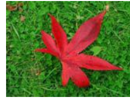
a) Source Image

The two measure of contrast discuss in the previous phase are calculated over the all image pixels. In the final step we assign the saliency value to the all pixel regions. The presented work inspired by the mechanism of this step as it allow the assignment of saliency value to those pixel also for which sufficient pixel accurate information is not available at this stage because of the abstraction phase of the process.