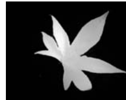
e) Saliency Achieved