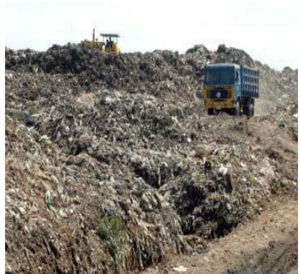
Fig 5: Mulund Dumping Ground

The study found that about 2% of the total MSW generated in Mumbai is openly burnt on the streets and 10% of the total MSW generated is burnt in landfills by humans or due to landfill fires.