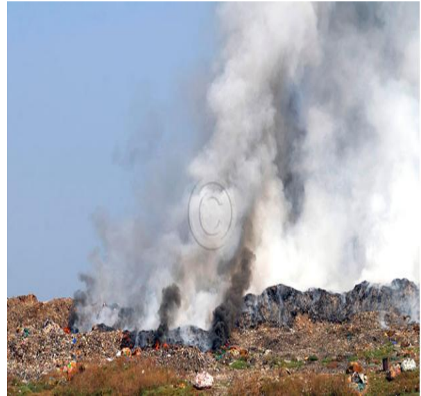
Fig 4: Mulund Dumping Ground