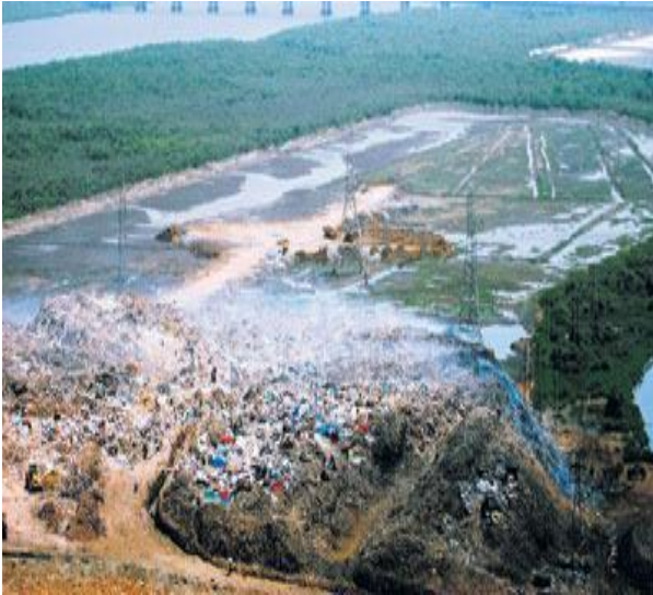
Fig 2: Burning of solid waste