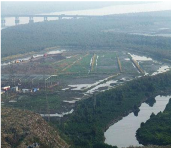
Fig 3: Mulund Dumping Ground