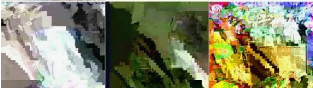
Fig. 4: Encrypted video frames with hidden data.

Step5: Generate the same pseudo-random sequence that was used in embedding process according to the data hiding key. The extracted bit sequence should be decrypted to get the original additional information.