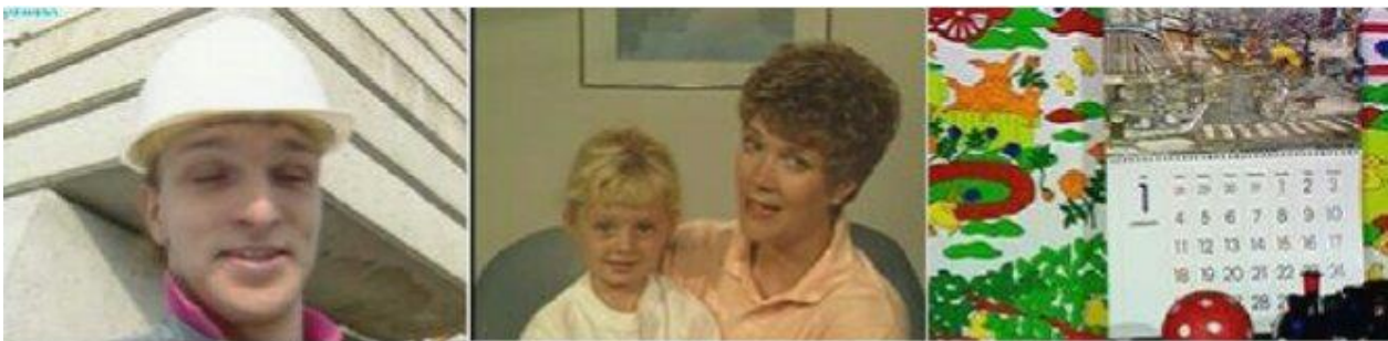
Fig 2: Original video frames