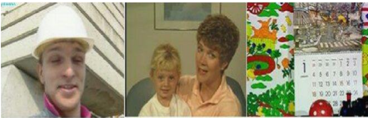
Fig. 5: Decrypted video frames with hidden data.