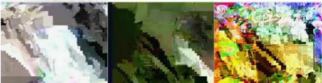
Fig 3: Encrypted video frame

The whole process of decryption and data extraction is given as follows.