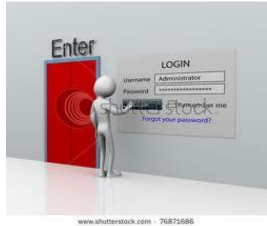
Fig 2:3d man secure login with administrator ID and password

To analyze and study how secure a system is, we have to consider,