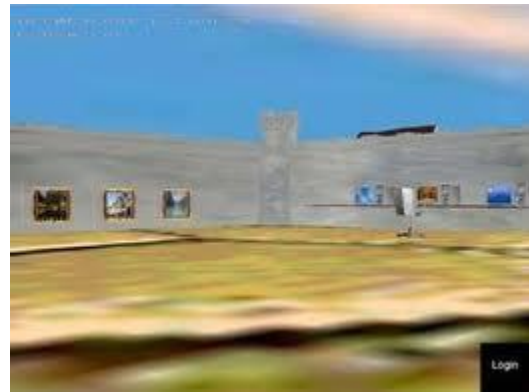
Fig 1: 3d password selection and inputs