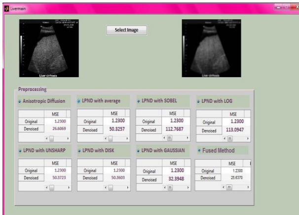
Fig 2: Comparison of Speckle Reduction by fused method and various speckle reduction methods

Figure 2 has shown the comparison of speckle reduction by fused method with various above said algorithms.