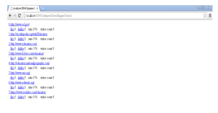
Figure 4: Initial Results

Here Figure 4 is showing the results obtained from the web server based on user query. The query results are presented as the base results and decide the initial ranking based on the relevancy vector,