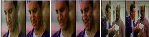
Fig. 2: Images taken from different sources. Left to Right: Face Image 176×112 MPEG1, Face Image 160×120 AVI

Management and storage of such a large volume of multimedia data is also a challenging area of research. Even fast retrieval of data from such a huge amount of data is also brain hammering task.