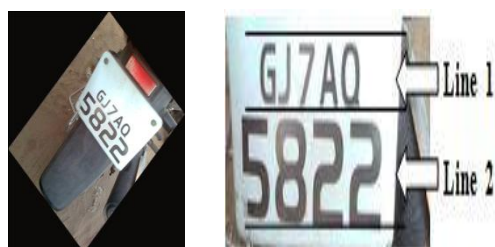
(a) Skewed image (b) Number plate with lines