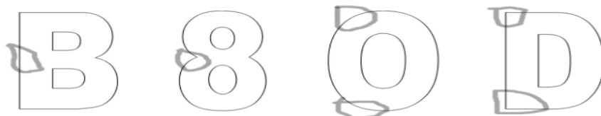
Fig.3. Distinguishing parts of ambiguous characters in [49].