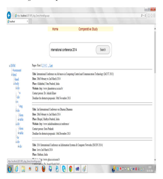
Figure: 3 Result of Hidden Web Retrieval

Figure 2: Implementation of Hidden Web Retrieval