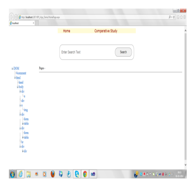
Figure 2: Implementation of Hidden Web Retrieval

(2) Some text blocks like DI, PO, PE and TO, which have clear vision and text content features, have better classification results. The average F1-measure on these blocks is 0.99.