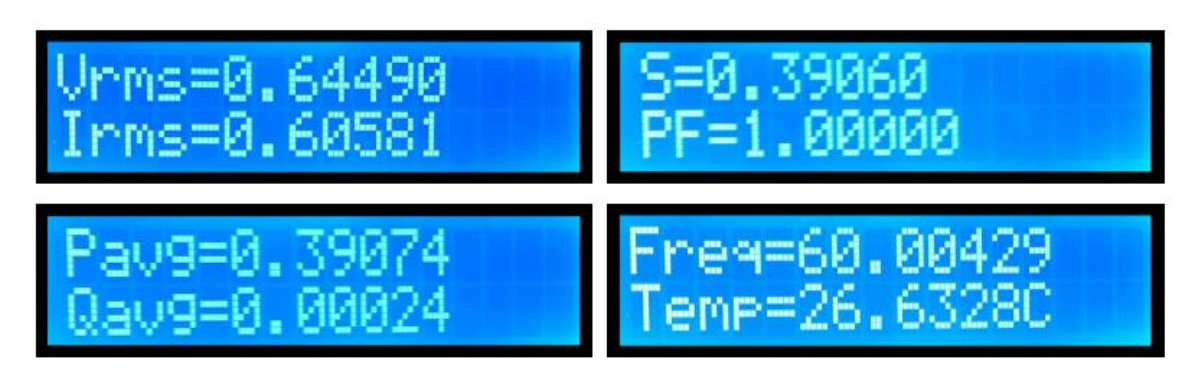
Fig 2: the system output displayed in the PC (or) LCD.