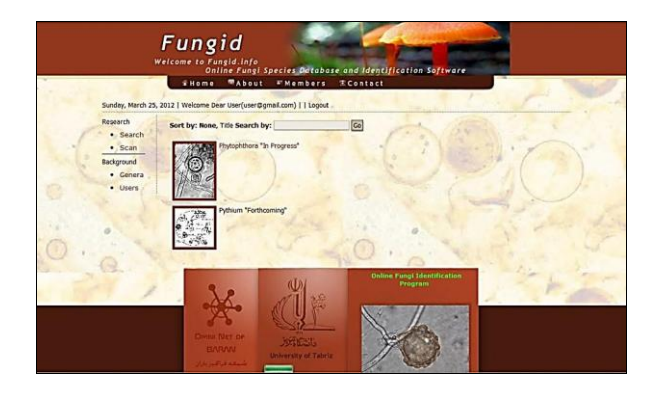
Fig. 6. The Genera section of the program.

We try to complete the details of the species via adding the descriptions and images. One of the major limitations in the creating web documents is copyright. Many copyright holders are reluctant to permit use of their images, because anyone can save the image to a file on their computer and use it later without obtaining permissions [33]. Although, we linked each species to useful websites like that Q-bank and Index Fungorum. So our trying to complete the program will be a gradual work. In Genera icon, user can see the genera that have been defined to the program with their species. Some of Genera labeled with "in progress" and/or "Forthcoming", that it means the process of completeness of the genera are not finished and it is under maintenance and the process of preparation of the genera and its species will start soon (Fig. 6).