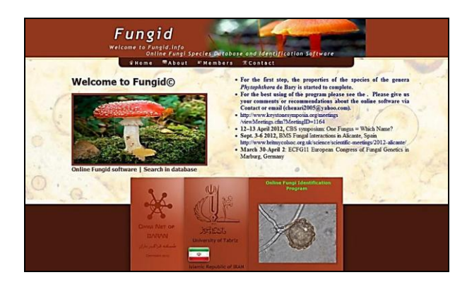
Fig. 1. Homepage of the Fungid.

In Fungid homepage (www.fungid.info ), there are two main icons, Go to Database and Search in Database (Fig. 1).