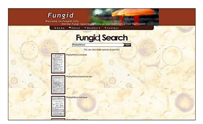
Fig. 3. The Search section of the program.

In Search icon, the user can do a general exploring based on the fungus name and find it (Fig. 3).