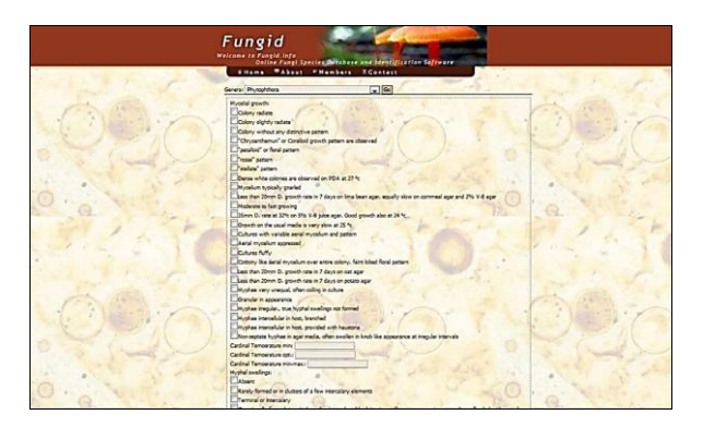
Fig. 4. The Scan section with a form that the user must fill in with morphological features of the unknown species. None of the characters were defined as required icons.

In Scan icon (the most important icon of the program), the user can choose the genus name via a combo-list. After selecting the genus and clicking on Go , the user can fill in the form of the Scan page which is based on morphological features. None of the characters were defined as a required matter. By mouse clicking on Scan, the software compares the entry with submitted information in the database and finally, one or more than one species are proposed to the user (Fig. 4).