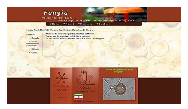
Fig. 2. Database layout of the Fungid.

In the first menu, the users must fill in the form with his/her username and password to enter and see the database contents. Certain of ID for users are supported by Administrator of the website. Users must send their request to receive the ID through the Contact menu. After log in, users can see the contents of the database such as Search , Scan , Genera and User icons without any possibility to edit or delete them (Fig. 2).