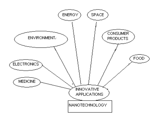
Fig 1: Application areas of nanotechnology

The field of nano-technology covers a broad area of expertise. Classical fields of Physics, Chemistry, Material Science, and Electrical /Mechanical /Chemical Engineering all are involved in the "new" field of nano. Research and development in that area is by its very nature inter-disciplinary. This presentation will give a personal perspective of any engineer in the area of nanoengineering. Besides engineering there are many disciplines like medicine, space, food, consumer products and environment in which nanotechnology is involved. The use of nanotechnology makes the applications of these disciplines very cost-effective, novel and will continue to have positive social impact.