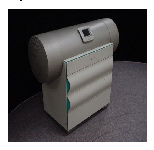
Drum Imagesetters (DOLEV & LOTEM 400/800 Imagesetter Printing Machine)