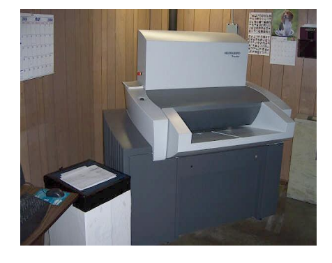
Computer-to-Plate (CtP) manufactured by Heidelberg, German