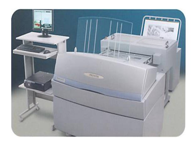
Sophisticated\ version\ of\ Computer-to-Plate\ (CtP)