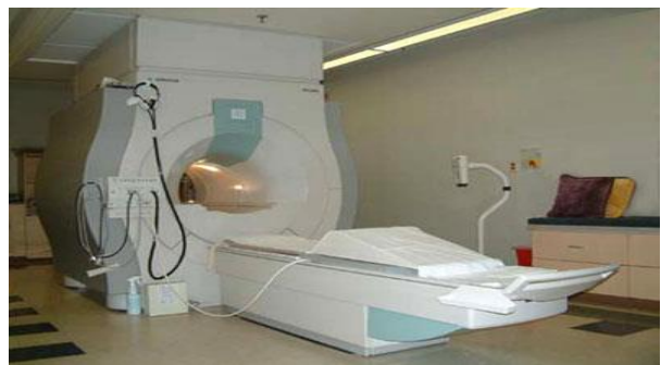
Fig1:-MR images machine [10]

For an MRI test, the part of the body for which the information of its internal structure is required is placed inside the machine that has strong electromagnets to produce magnetic field. The output of MR scans is digital image in DICOM format that can be saved and stored for analysis and future reference. The MR image can be viewed and transported to places such as clinics or operating room where doctors may require it.