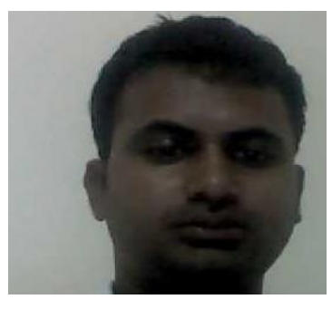
Fig 2:-Captured Image

An image which taken inside a vehicle includes the drivers face. Typically a camera takes images within the RGBmodel (Red, Green and Blue). However, the RGB model includes brightness in addition to the colors. When it comes to human's eyes, different brightness for the same color means different color. When analyzing a human face, RGB model is very sensitive in image brightness. Therefore, to remove the brightness from the images is second step. We use the YCbCr space since it is widely used in video compression standards .Since the skin-tone color depends on luminance, we nonlinearly transform the YCbCr color space to make the skin cluster luma-independent. This also enables robust detection of dark and light skin tone colors. The main advantage of converting the image to the YCbCr domain is that influence of luminosity can be removed during our image processing. In the RGB domain, each component of the picture (red, green and blue) has a different brightness. However, in the YCbCr domain all information about the brightness is given by the Y component, since the Cb (blue) and Cr (red) components are independent from the luminosity. Below fig.2 represents captured image