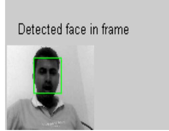
Fig 6:-Image with Haar-Feature

Viola-Jones algorithm [14] has been developed with face detection