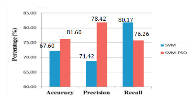
Fig 6.1 Comparison Result of SVM and SVM-PSO

Figure 6.1 describes that the comparison result of SVM and SVM-PSO with data cleansing. Based on Figure 6.1, SVM-PSO gives better solution for accuracy and precision. On the other hand, SVM provides better value for recall than SVM-PSO. The best accuracy level that gives in this study is 81.60% thatbeen achieved by SVM-PSO after data cleansing.